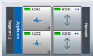
Monitor mode – network traffic going to the tool from both directions, heartbeat detected.

The Copper Bypass TAP provides heartbeat functionality to automatically detect a tool failure. It does this by inserting heartbeat packets into the network traffic going to the network tool from both directions. The Copper Bypass TAP then continually monitors the attached devices at very short intervals. If the expected number of packets are not returned within the specified interval, the blade assumes that a failover condition has occurred and quickly switches to Bypass mode. While in Bypass mode, network traffic is diverted around the unresponsive tool reducing the risk of lost network data. If the condition that caused the port to switch to Bypass mode corrects itself within the specified timeframe, then the mode could automatically switch back to the normal Monitor mode.