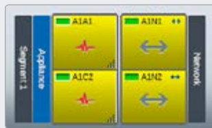
Failover condition – faulty heartbeat link detected and switches to Bypass mode.