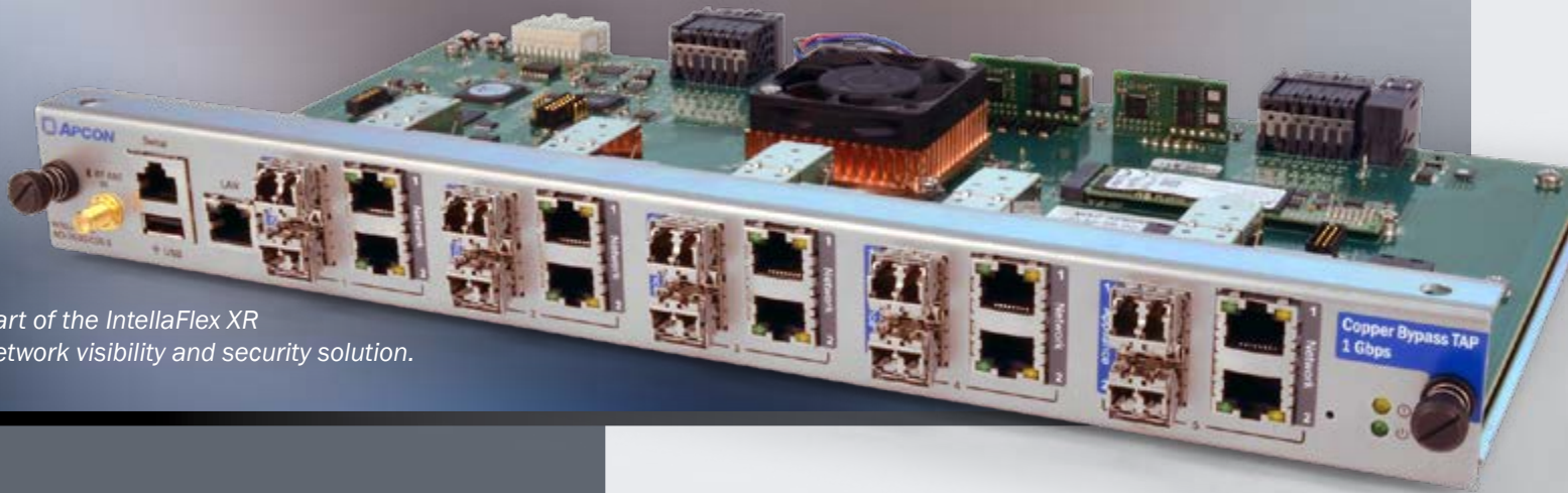
Part of the IntellaFlex XR network visibility and security solution.

Active network protection from inline security tool failure